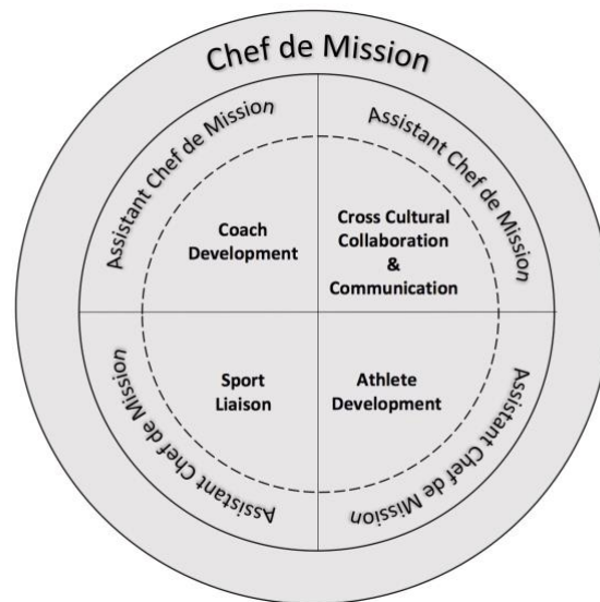
Fig. 1. Operational structure and key priorities of Team Mi'kmaw Nova Scotia.

Team Mi'kmaw Nova Scotia Executive is comprised of the Chef de Mission and Assistant Chef de Mission. The Mission Staff itself is comprised of the Executive and selected volunteers. In the interim, all activities related to Team Mi'kmaw Nova Scotia will be coordinated via the Executive. The Executive will work closely with volunteers assigned to work in the four key processes identified as Team Mi'kmaw Nova Scotia priorities for the North American Indigenous Games (NAIG) (Fig. 1): coach development, athlete development, sports liaison, and cross-cultural collaboration and communication.